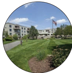
The Willows at Westborough