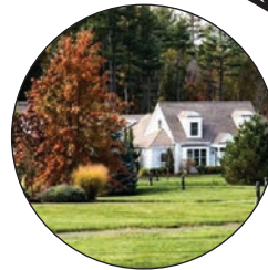
The Commons in Lincoln