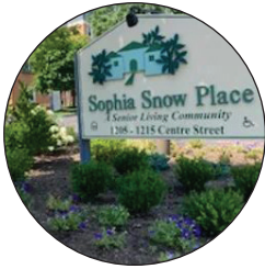
Sophia Snow Place