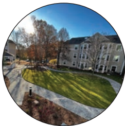
Loomis Lakeside at Reeds Landing