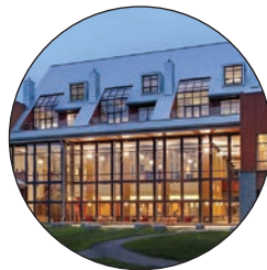
Newbridge on the Charles