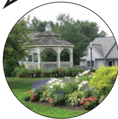
The Briarwood Community