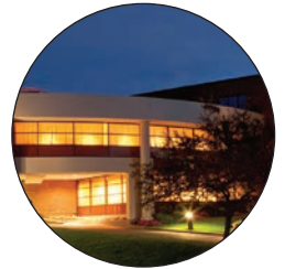
Southgate at Shrewsbury