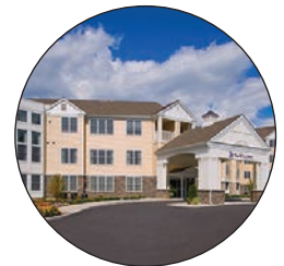
The Willows at Worcester