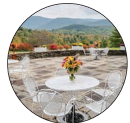
Sweetwood of Williamstown