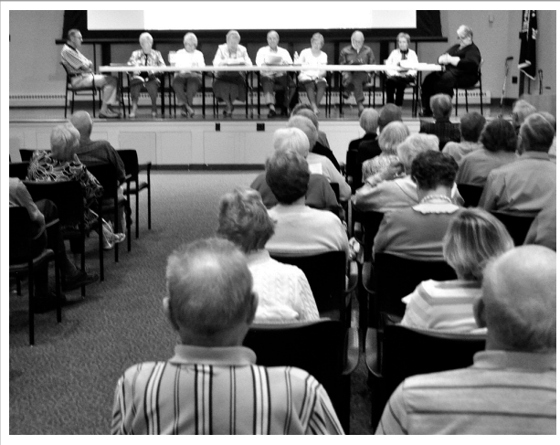
Residents Meeting at The Overlook in Charlton